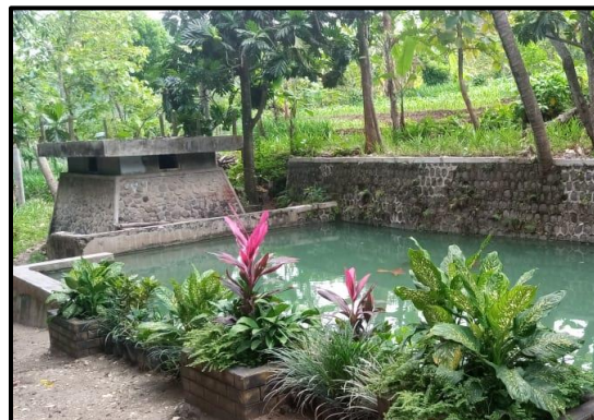
Figure 2. Sendang Watu Dukun

According to sources, the Watu Dukun Site was initially believed by the community to be just a sacred place or danyangan . However, in 2010 it began to be designated as a site believed to be the place where King Airlangga and Empu Narotama studied with Empu Bharada. At the Watu Dukun Site, there are 2 stones in the form of sculptures in the form of palawi writing, 4 (four) chair stones and stones resembling tables (altars), and other types of stones, as well as Watu Dukun sendang (Bibit, 2022). Efforts were made by the Village Head and the local community with the installation of roofs and guardrails to maintain the authenticity and security of the site at the site. According to Fatchurrahman (2022), the spring water source ( sendang ) at the Watu Dukun Site is used for agricultural irrigation and clean water needs. Sendang is separated by a partition, where the western part of sendang is only used for religious rituals and purification before entering the Watu Dukun Site area. The eastern part of Sendang is used for agricultural irrigation (Figure 2).