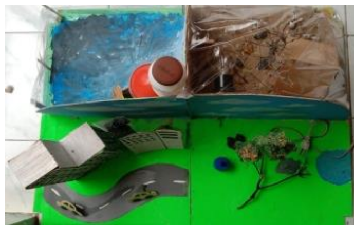
Figure 1. Climate Change Demonstration Tool

The design stage is designing a collective teaching aid (educational learning box) as in Figure 1. The design of this teaching aid explains the picture regarding the causes and impacts of climate change. Therefore, the existence of collective learning media can help students combine theory with contextual events because students can see directly the phenomena contained in the teaching aids so that students become motivated to be enthusiastic and more active in learning activities so that it makes it easier for them to understand material, this is in line with Alhaddad's (2012) statement that students aged 7-11 years already have the ability to think logically about concrete events and are able to classify objects into different forms. Collective learning media on climate change material is designed as in Figure 1.