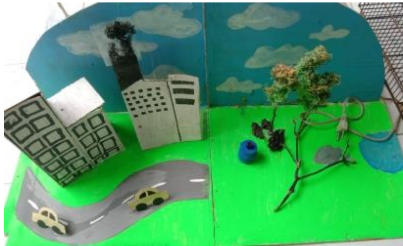
Figure 2. Causes of climate change

with each section having a different discussion. The first partition with the widest size contains miniature buildings, factories, car smoke, and damage to trees which explains the causes of climate change. As seen in figure 2