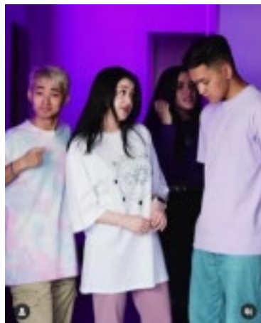
Posted on Tuesday, May 10 with caption “@kex_house